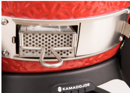
Patented Ash Collector