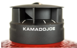
Kontrol Tower Top Vent