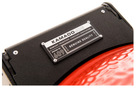
Air Lift Hinge