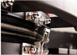
Stainless Steel Latch