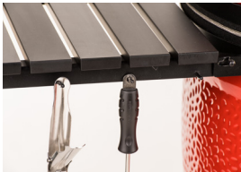
Aluminum Side Shelves