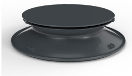
Patented Hyperbolic Insert