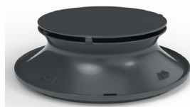
Patented Hyperbolic Insert