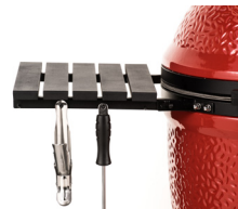
Aluminum Side Shelves