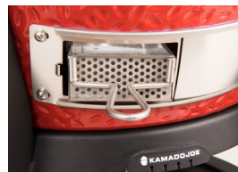
Patented Ash Collector