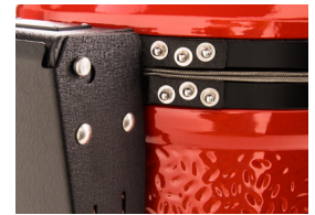
Air Lift Hinge