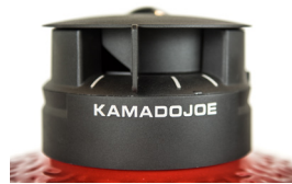
Kontrol Tower Top Vent