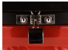
Stainless Steel Latch