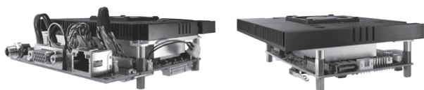
▲ Assembly view