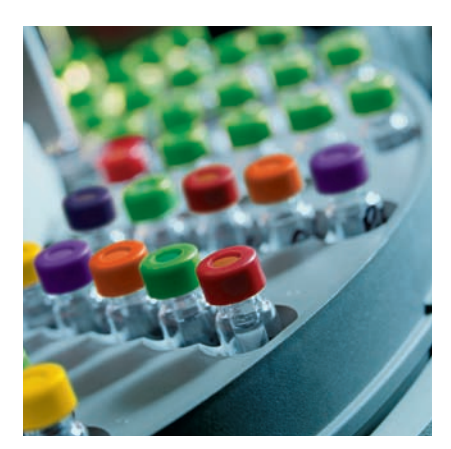
Pharmaceutical Positioning transparent ampoules, detecting and counting the smallest tablets