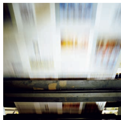
Printing and paper industry Counting printed copies, detecting paper web tears