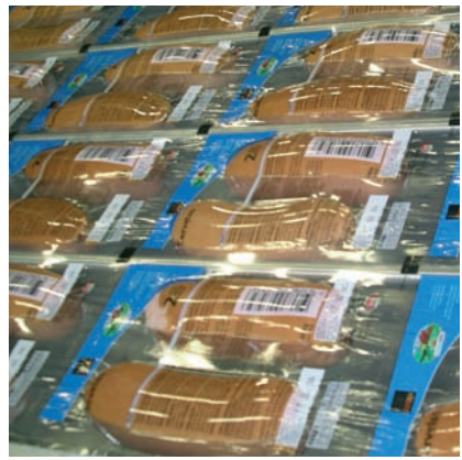
Packaging technology Reliably detecting many different packaging materials and designs, coping with demanding tasks

The quality of your system is heavily influenced and determined by the uses of optical sensors.