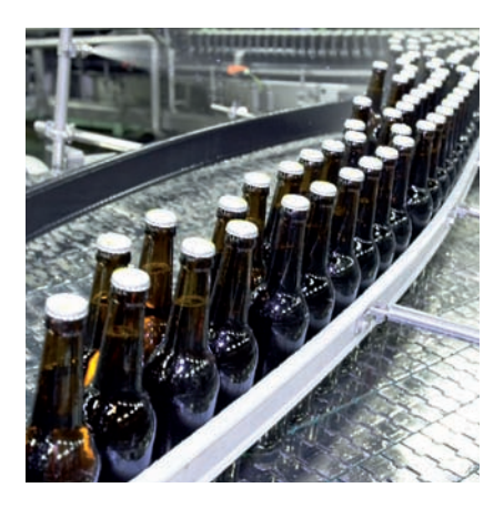
Food/beverage industry Detecting bottles, counting cups, positioning trays