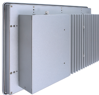
▲ Rear view