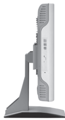
▲ Slim design