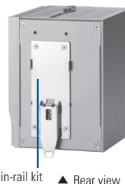
Din-rail kit ▲ Rear view