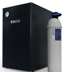
BRITA PROGUARD Coffee