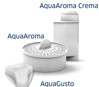
AquaAroma Series/ AquaGusto