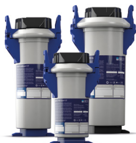
PURITY Quell ST