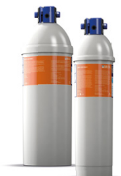
PURITY C Steam