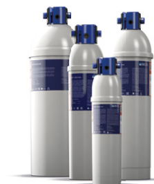
PURITY C Finest