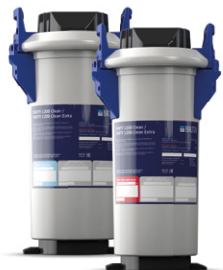
PURITY Clean/ PURITY Clean Extra