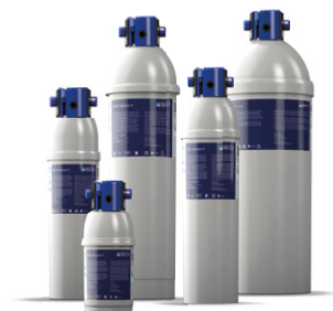
PURITY C Quell ST