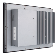
▲ Rear view