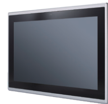
▲ Side view