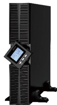
Display panel can be rotated